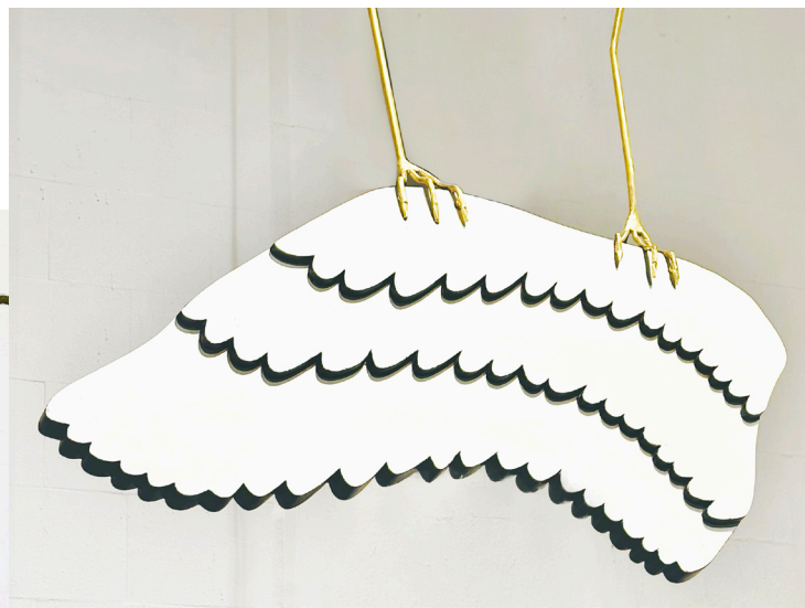
ik-HO-rus - Act II , 2023, Bronze, wood, steel