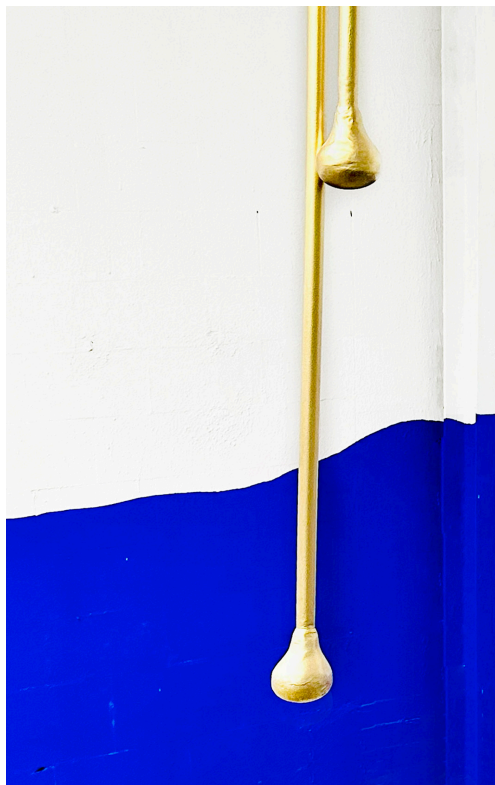
ik-HO-rus - Act I , 2023, Bronze, wood, soil