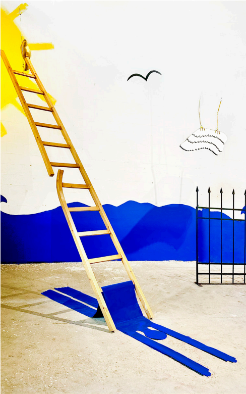
ik-HO-rus - Act III , 2023, Bronze, wood, vinyl